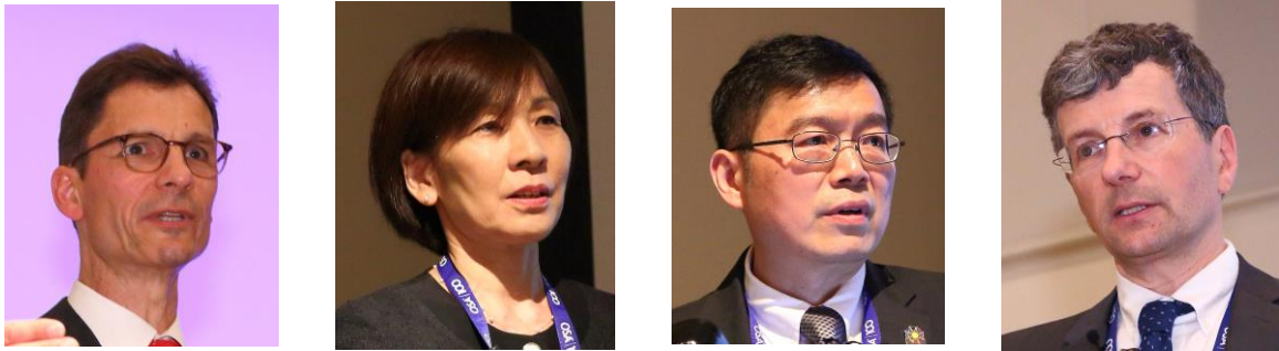
Fig. 3 Plenary speakers of OPIC2018:

waves with intense laser beams especially in his lab. Several recent results were presented.