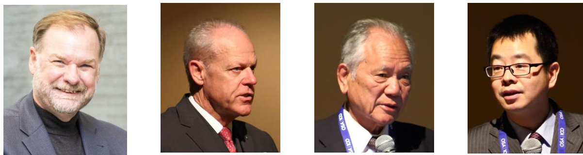
Fig. 1 Congress Co-Chairs of OPIC2018: