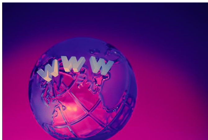
Figure 1. Figure captions are indented 5 spaces and justified. If you are familiar with Word styles, you can insert a field code called Seq figure which automatically numbers your figures.

Figures are centered. Use or insert .jpg, .tiff, or .gif illustrations instead of PowerPoint or graphic constructions. Captions go below figures. Indent 5 spaces from left margin and justify.