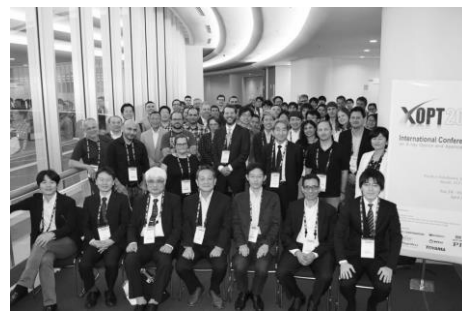
Fig. 2. Photograph of XOPT2018.

Monochromatic figures are recommended. Color figures or photographs can be used, but please note that the book of Abstract will be printed in black and white. A caption should be attached to each figure and table. An example is shown in Fig. 2.