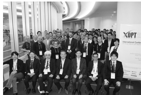
Fig. 2. Photograph of XOPT2018.

Monochromatic figures are recommended. Color figures or photographs can be used, but please note that the book of Abstract will be printed in black and white. A caption should be attached to each figure and table. An example is shown in Fig. 2.